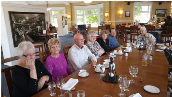
Dynamic Dinners enjoying Bigwin Island luncheon.