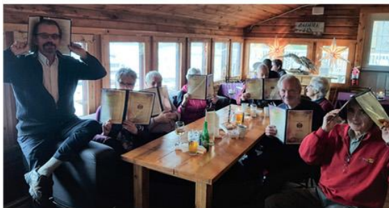
Out to Lunch Bunch enjoyed a lovely time together -great atmosphere, excellent service along with lots of laughter at Creative Plate Eatery