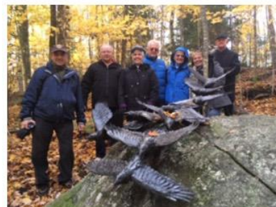
Strolling at the Haliburton Sculpture Forest